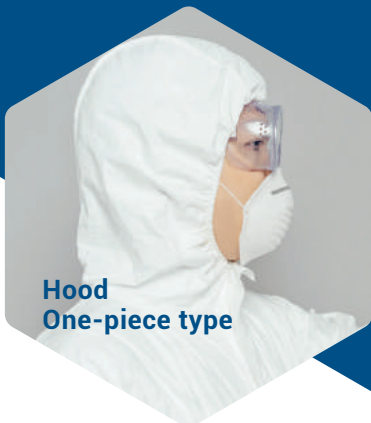
Hood One-piece type

EUROPE ISO 16604, EN 14126 USA ASTM F1670, 1671